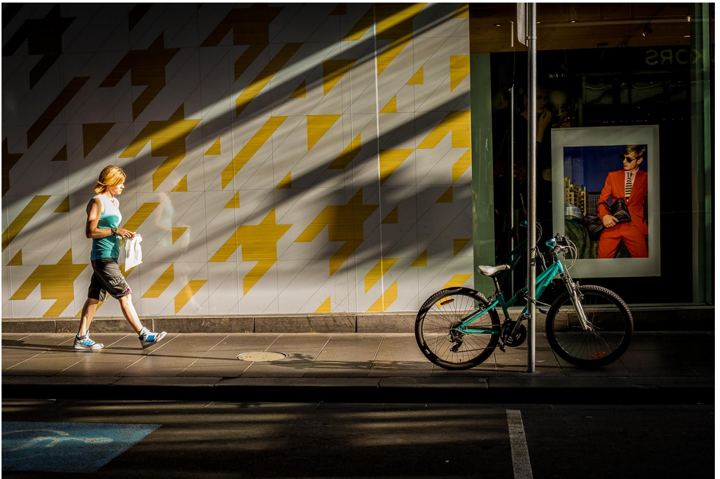
“I See You”