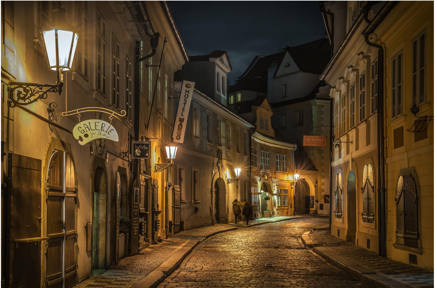
"Prague at Night"