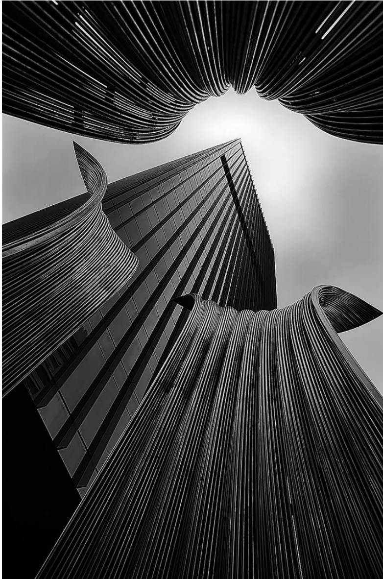
“Plea for Justice”