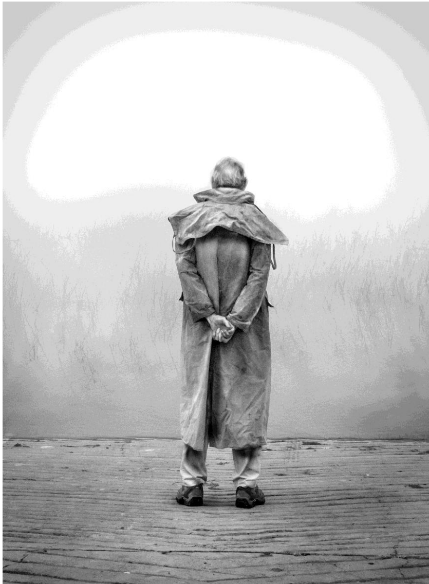
"Into the Mist"